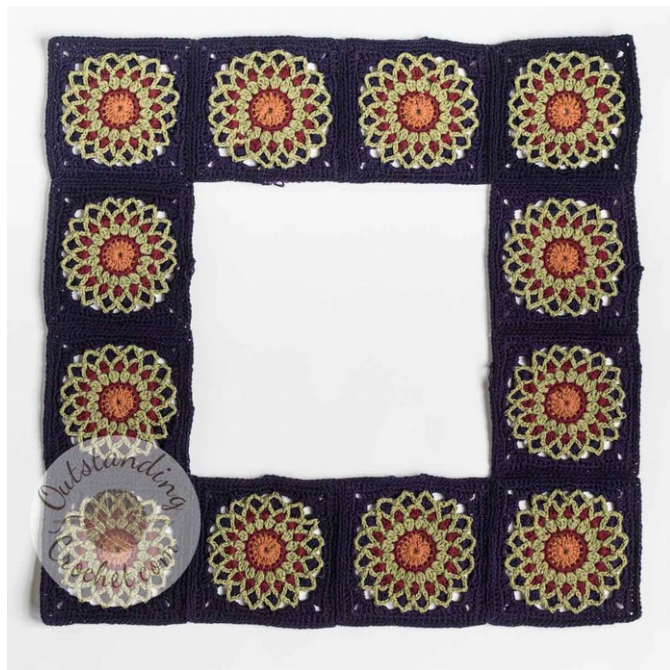
4 x 4 motif border (x2)