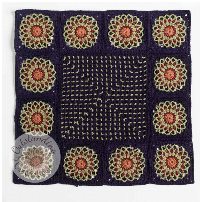
Block stitch square: joined as you go in last round to inner side of motif border (x2)